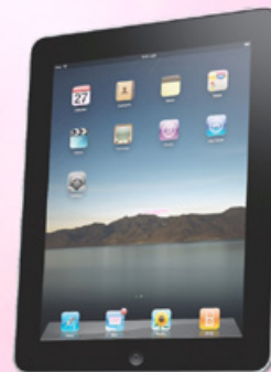
Full-size iPad Air ($599 value)